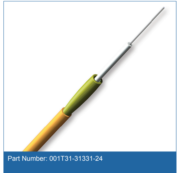
Part Number: 001T31-31331-24

UL-1666 and CSA FT-4 (for riser and general building applications); ICEA S-83-596