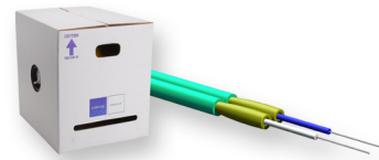
Part Number: 002T51-31190-B2

Flame Resistance UL-1666 (for riser and general building applications)