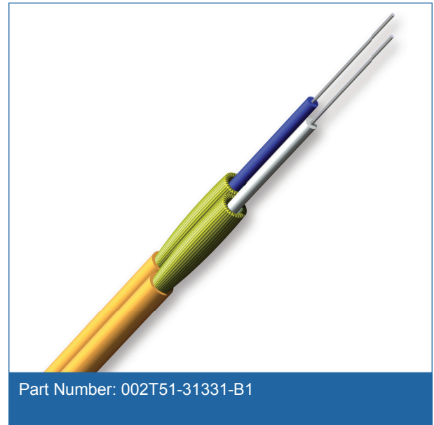
Part Number: 002T51-31331-B1

Flame Resistance UL-1666 (for riser and general building applications)