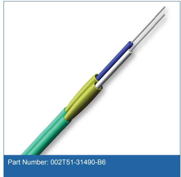
Part Number: 002T51-31490-B6

Flame Resistance UL-1666 (for riser and general building applications)