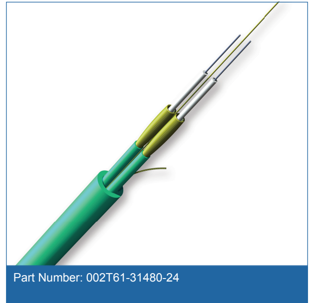
Part Number: 002T61-31480-24

This cable is available in 12 different jacket colors – blue, orange, green, brown, slate, white, red, black, yellow, violet, rose and aqua. The colored jacket allows for easy visual identification of the cables. The standard jacket color will be determined by the dominant fiber type in the cable and will use the standard part numbers shown here. Contact Customer Care at 1-800-743-2675 to order other color options.