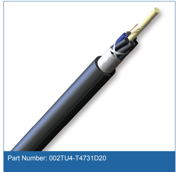
Part Number: 002TU4-T4731D20

Corning ALTOS® cable with FastAccess® technology is an all-dielectric gel-free cable designed for outdoor and limited indoor use for campus backbones in lashed aerial and duct installations. The innovative FastAccess technology feature combined with the all-dielectric gel-free loose tube design simplifies removal of the cable jacket reducing cable end access time by at least 50 percent. Equally important is the overall reduction in risk of inadvertent fiber damage and risk to installers from sharp cable access tools. The cable is fully waterblocked using craft-friendly, water-swellaible materials, which means no clean up is required. The flexible buffer tubes are easy to route in closures, and the SZ-stranded, loose tube design isolates fibers from installation and environmental rigors while allowing easy mid-span access. The all-dielectric gel-free cable construction requires no bonding or grounding, and these cables have a medium-density polyethylene jacket that is rugged, durable and easy to handle. A variety of fiber types are available including 62.5 µm and 50 µm, single-mode and hybrid versions, as well as fibers with Gigabit and 10 Gigabit Ethernet performance.