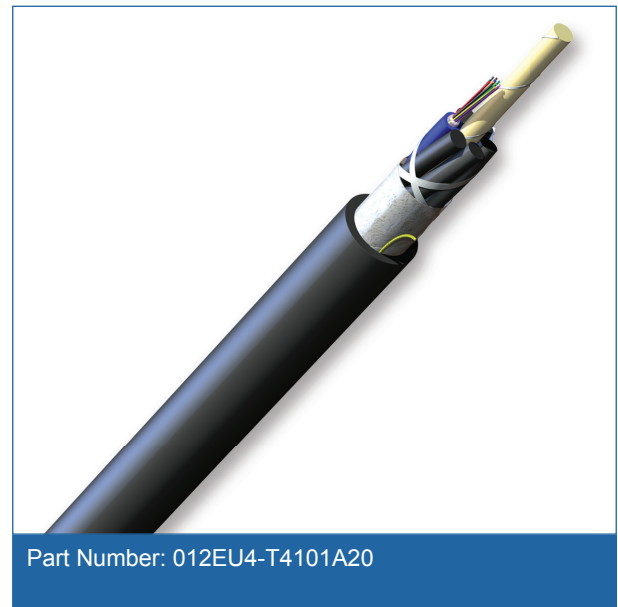
Part Number: 012EU4-T4101A20

Design and Test Criteria Telcordia GR-20, ICEA-640