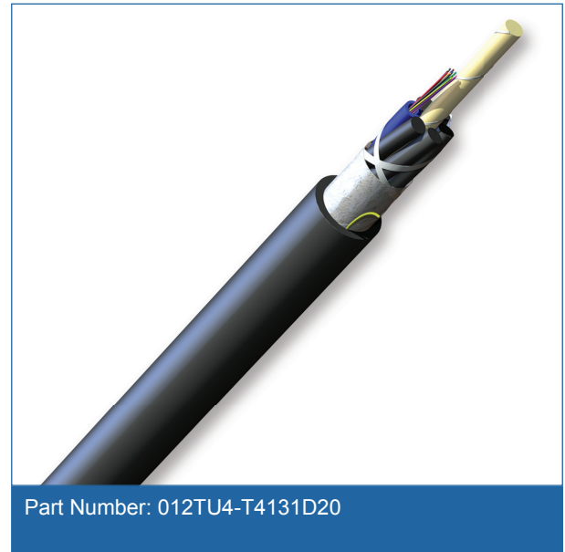
Part Number: 012TU4-T4131D20