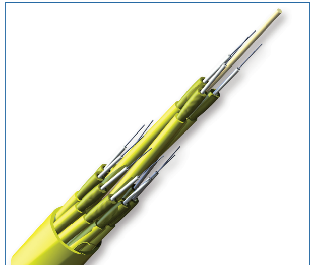
Part Number: 012U61-31431-24

UL-1666 (for riser and general building applications)