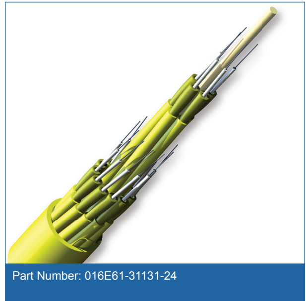
Part Number: 016E61-31131-24

This cable is available in 12 different jacket colors – blue, orange, green, brown, slate, white, red, black, yellow, violet, rose and aqua. The colored jacket allows for easy visual identification of the cables. The standard jacket color will be determined by the dominant fiber type in the cable and will use the standard part numbers shown here. Contact Customer Care at 1-800-743-2675 to order other color options.