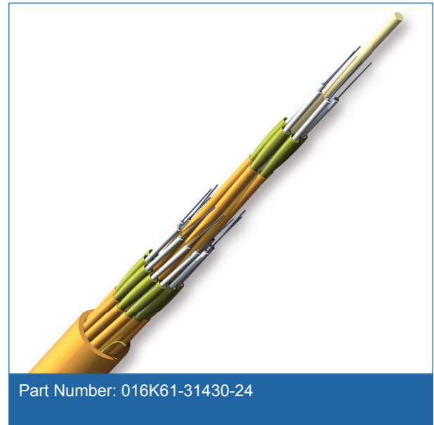
Part Number: 016K61-31430-24

UL-1666 (for riser and general building applications)