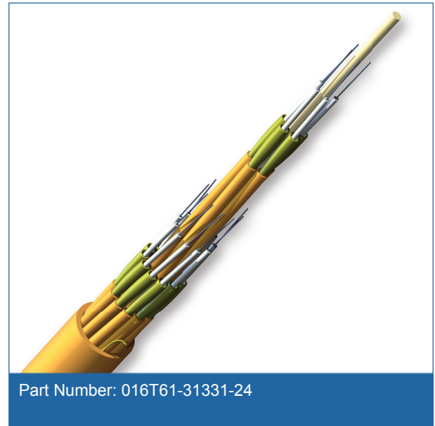
Part Number: 016T61-31331-24

UL-1666 (for riser and general building applications)