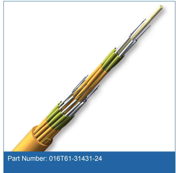
Part Number: 016T61-31431-24

UL-1666 (for riser and general building applications)