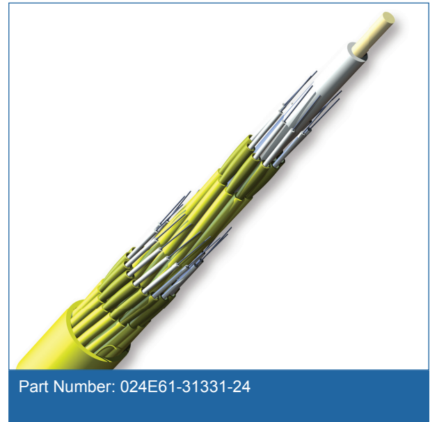
Part Number: 024E61-31331-24

UL-1666 (for riser and general building applications)