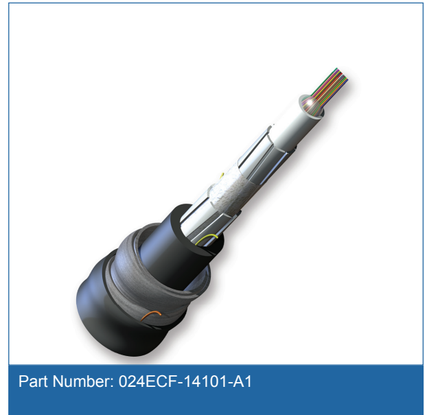
Part Number: 024ECF-14101-A1