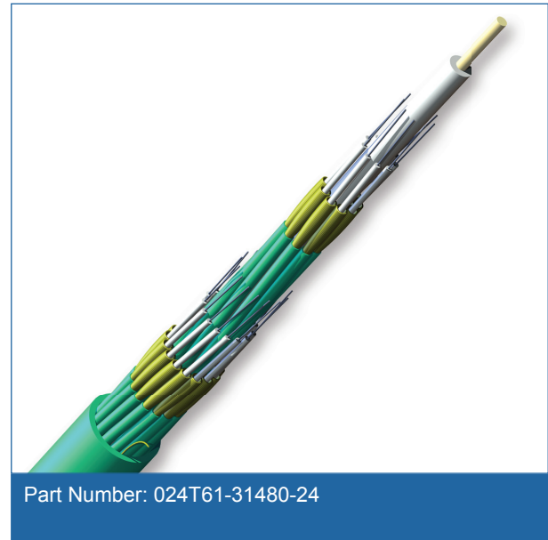
Part Number: 024T61-31480-24