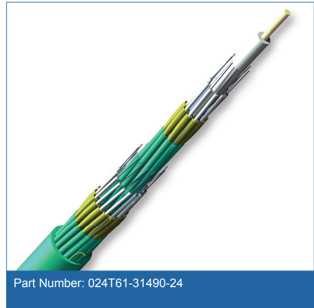
Part Number: 024T61-31490-24