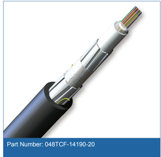
Part Number: 048TCF-14190-20

Outdoor aerial and duct; indoor vertical riser and general purpose horizontal according to NEC Article 770