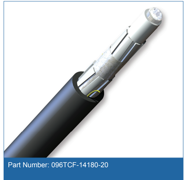
Part Number: 096TCF-14180-20

Outdoor aerial and duct; indoor vertical riser and general purpose horizontal according to NEC Article 770