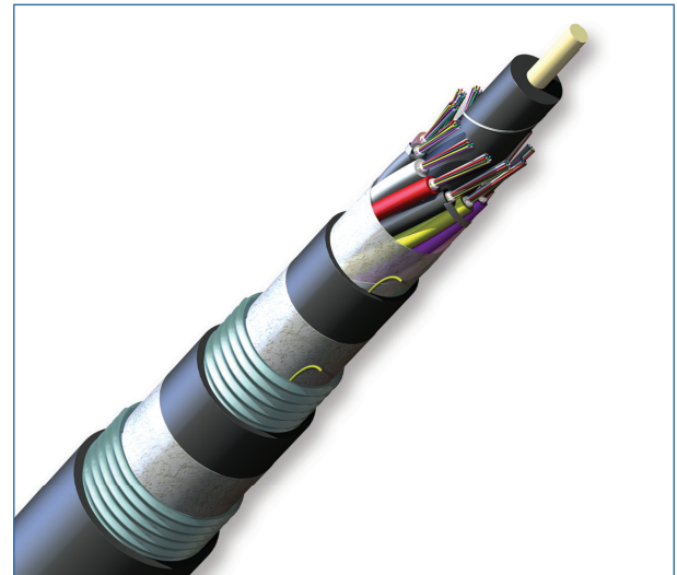
Part Number: 144TU6-T4131A20

Design and Test Criteria Telcordia GR-20, ICEA-640