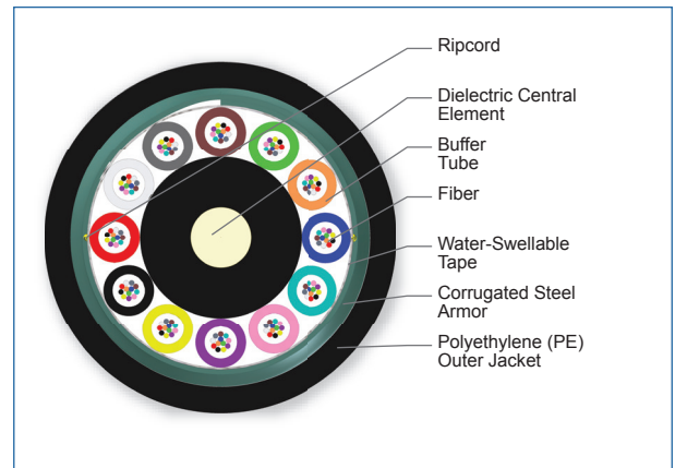
Cross Section of Part Number: 144TUC-T4190D20