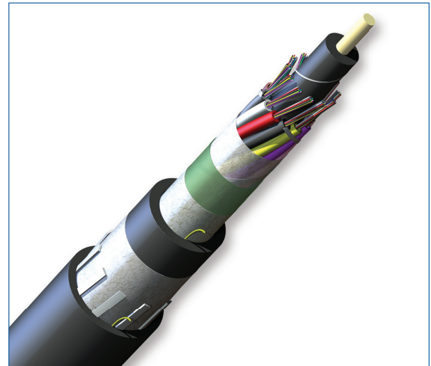
Part Number: 144TUL-T3691D2M

Mining Safety and Health Administration (MSHA) approved