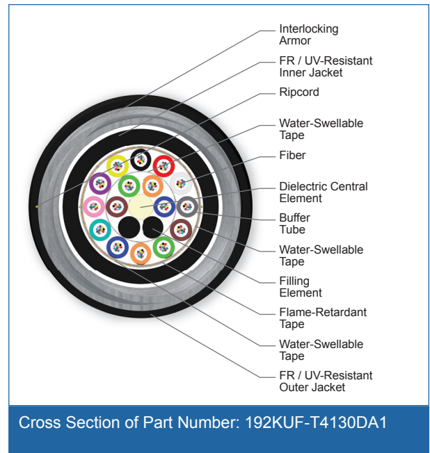
Cross Section of Part Number: 192KUF-T4130DA1