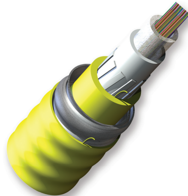
Part Number: 288EV7-14101DA1