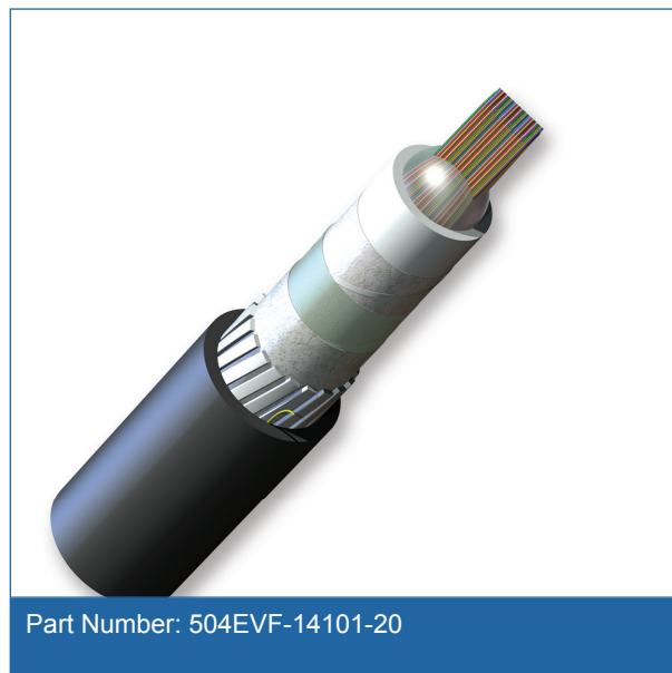
Part Number: 504EVF-14101-20