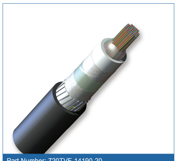
Part Number: 720TVF-14190-20