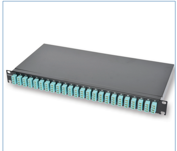
Part Number: LANC-196-AD-03Q-S1B

Available empty (1U) or preloaded with or without pigtails