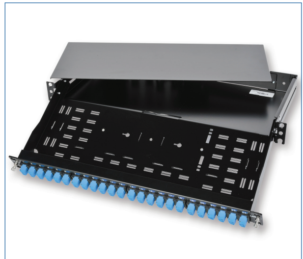
Part Number: LANS-148-AE-00R-S0B