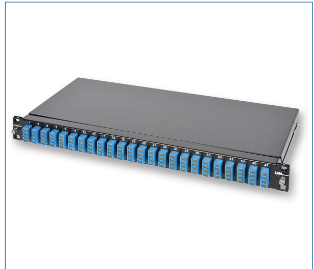
Part Number: LANS-196-AD-00Q-S0B

Housings are available empty (1U or 2U) or preloaded with or without pigtails